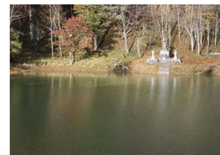
Ichi-no-ike Pond is known as the home of Shichimen Celestial Maiden, the Dragon Goddess.

Because of this, September 19th is celebrated as the founding day of Keishin-in Temple on Mt. Shichimen. The Grand Festival for Shichimen Celestial Maiden is held on this day each year. Many people climb Mt. Shichimen staying overnight to purify themselves and receive a special prayer.