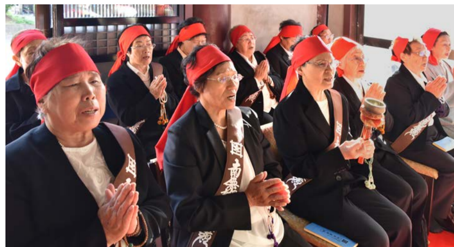
Niijima Islanders chanting the "Nami-Daimoku."