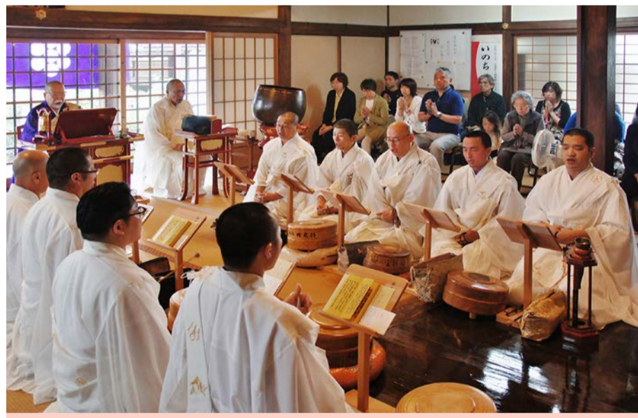
Nichiren Shu priests gather to recite dharanis a thousand times at Kyooji Temple in Sakai, Osaka.

In Nichiren Shu, when performing kito prayers, special blessing rituals, the shuhosshi , who have completed the rigorous 100-day ascetic practice, read the Lotus Sutra and the dharanis three times, followed by reciting the essential part of the sutra while flourishing bokken , wooden swords, to make prayers for the supplicants.