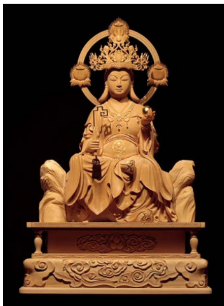
This statue of Shichimen Celestial Maiden is enshrined in the temple by Ichi-no-ike Pond.

Seven kilometers from Minobusan Kuonji Temple, stands Mt. Shichimen, which rises to an elevation of 1,982 meters. Keishin-in Temple, at the top of the mountain, is where Shichimen Celestial Maiden is enshrined. There are three folk stories about Shichimen Celestial Maiden that explain how and why Mt. Shichimen has been regarded as a sacred mountain for generations.